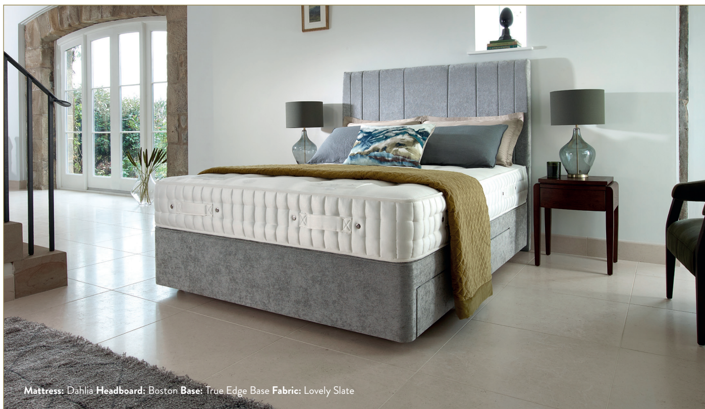
Mattress: Dahlia Headboard: Boston Base: True Edge Base Fabric: Lovely Slate

With layers of blended British wool and viscose, home-grown hemp and crisp cooling cotton. The Gardenia has 8750 innovative springs; including 100% recyclable advanced Cortec™ Quad pocket springs and pressure relieving HD 4000 Micro springs. With an in-house woven FR chemical free mattress cover and two rows of side stitching, this Seasonal Turn mattress has a warming wool winter side and cooling cotton summer side.