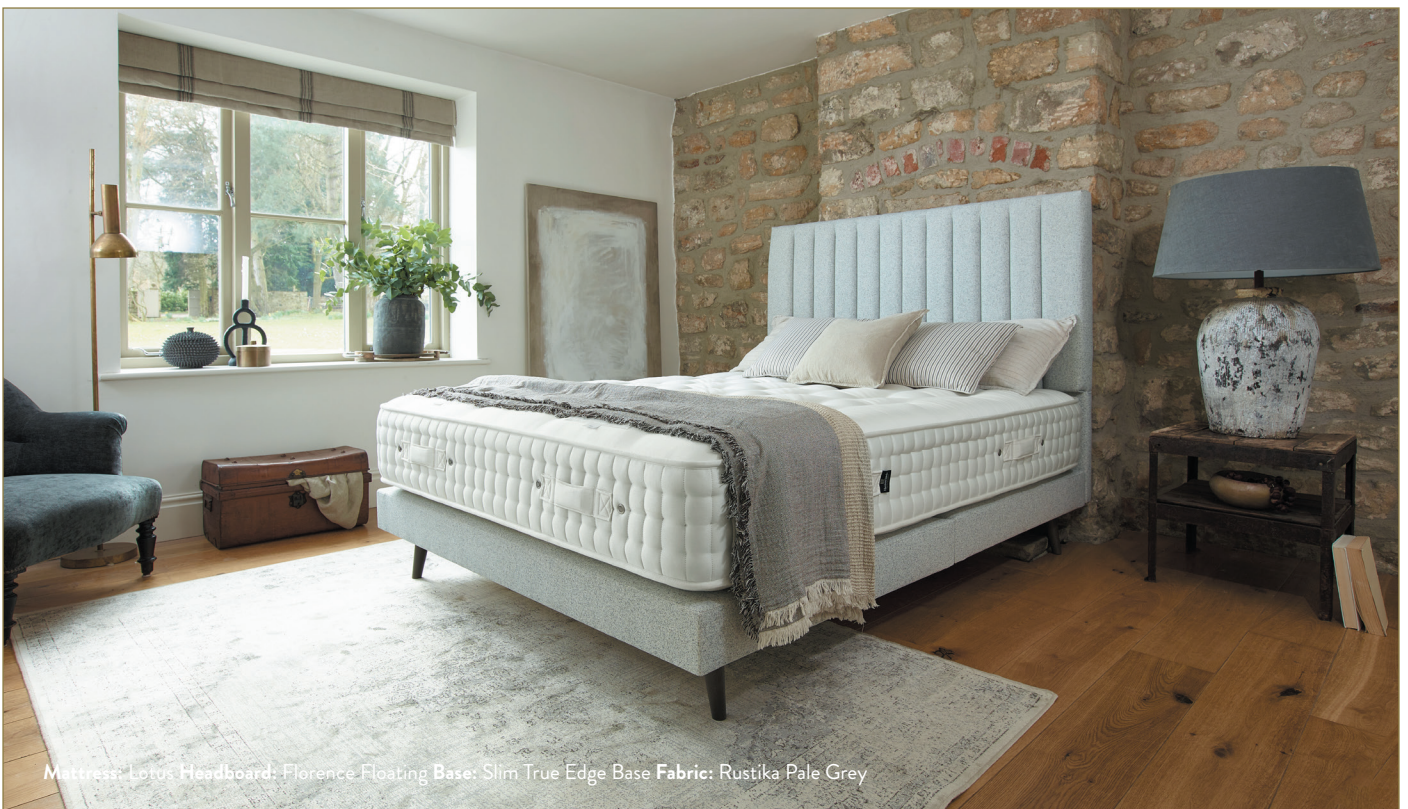
Mattress: Lotus Headboard: Florence Floating Base: Slim True Edge Base Fabric: Rustika Pale Grey

With layers of blended British wool and viscose, sumptuous mohair, home-grown hemp and flax and crisp cooling Egyptian cotton. The Lotus has 20750 innovative springs; including 100% recyclable advanced Cortec™ Quad, pressure relieving HD 4000 Micro, contouring Microlution Airflow and Posturfil pocket springs. With an in-house woven FR chemical treatment free mattress cover and three rows of side stitching, this Seasonal Turn mattress has a warming wool winter side and cooling cotton summer side. Choose from our three levels of support; gentle, medium or firm.