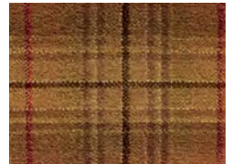
48/20016 Croft Gold