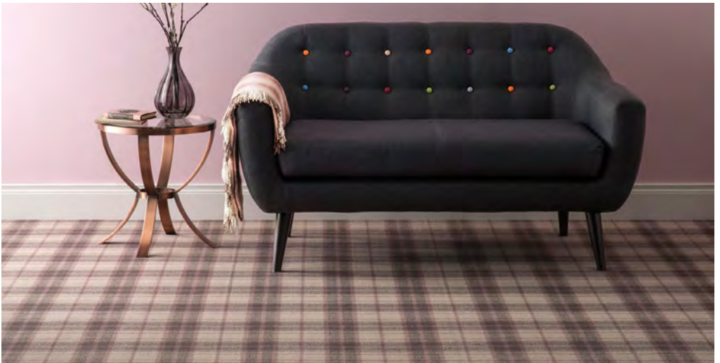
01/30006 Tea Rose