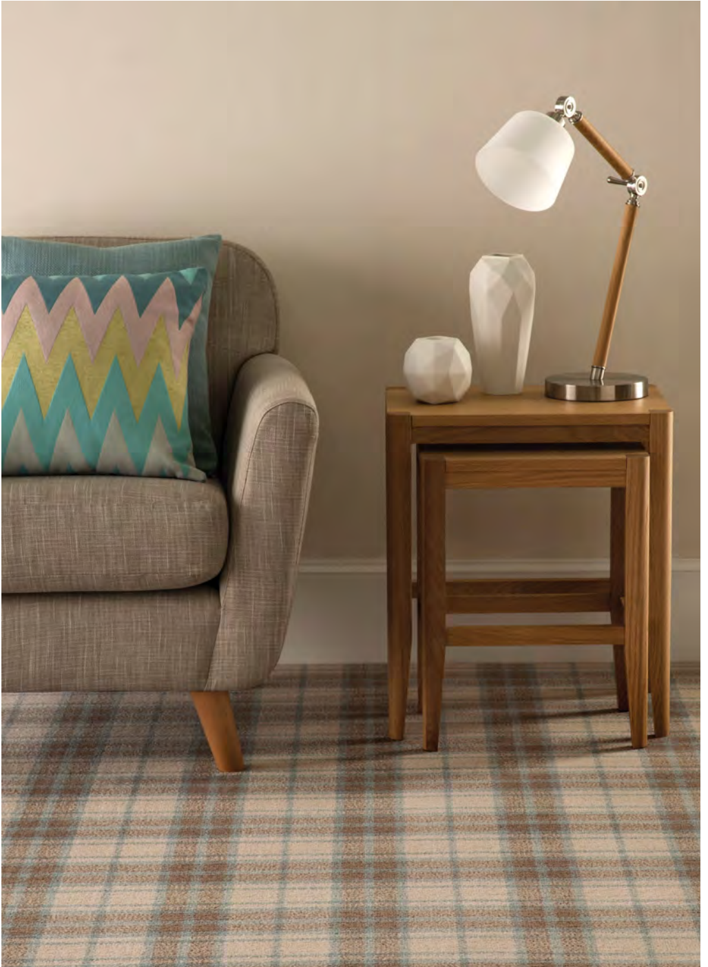
31/30006 Summer Breeze