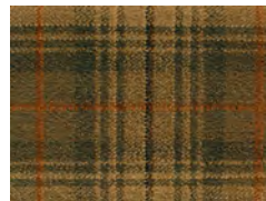
47/20016 Antique Green