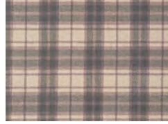
01/30006 Tea Rose

The Boho Collection is an ode to all things retro and the Hamilton range, gives the traditional plaid design a vintage inspired make-over combining it with a “heritage” colour palette and stunning pastel shades. The five stunning colourways co-ordinate with the remainder of the Boho Collection, allowing you to create an eclectic and unique space.