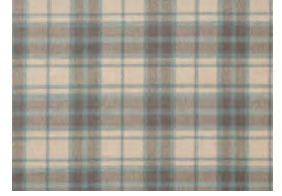
31/30006 Summer Breeze