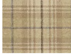
11/20016 Chalk Downs

This traditional design has been brought into the 21st Century: subtle tones and carefully placed highlights of colour create a carpet with depth and timeless appeal, in ten beautiful colourways.