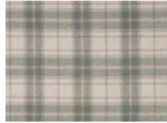
91/30006 Moon Shimmer