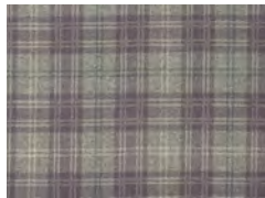
92/20084 Sea Holly