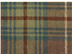
2/2755 Beige Chisholm