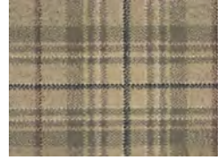
91/20016 Turtle Dove